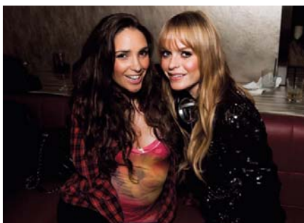
Guest DJ Taryn Manning with a fan