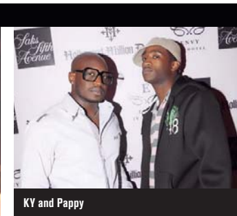
KY and Pappy