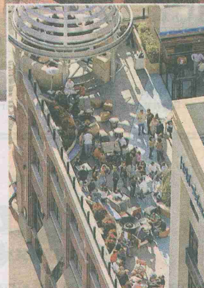
Night (top) and day (inset), Lounge Six offers romantic views of downtown San Diego from its perch above the Hotel Solamar.